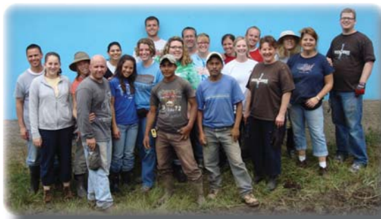
Harvest Bible Chapel, Iowa (Oct 14-24)

Are you interested in bringing a Short-Term Mission Team group to Guatemala?