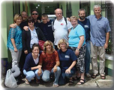
Peterborough, ON (Sept 22 - Oct 3)