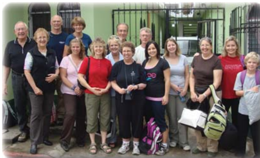
Kamloops Alliance Church, Kamloops BC (Oct 3-14)