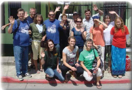
Big River Evangelical Free Church, Big River SK (Aug 31-Sept 11)