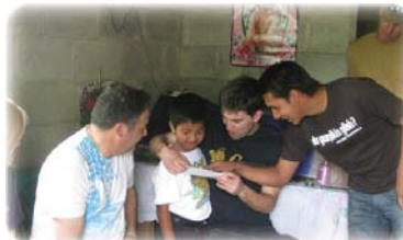
Kamloops Christian School Kamloops BC Team 1 (March 9-18)