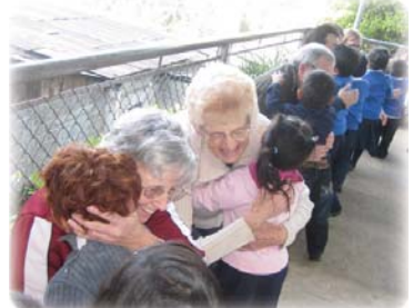
Regina Apostolic Church, Regina SK (Feb. 2 -12)