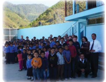
Hillsborough Baptist Church, Hillsborough NB (Jan 23 - Feb. 2)