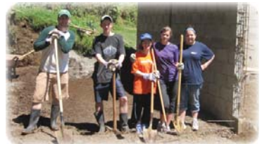
Linden Christian School, Winnipeg MB (Feb 15-25)