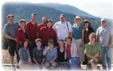
Belfast Presbyterian Church, P.E. I. (Jan 12 – 24)