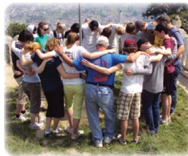
Bearspaw Christian School Calgary AB (March 31-April 9)