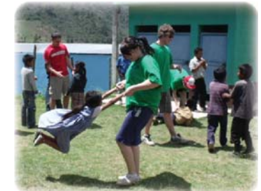
Kamloops Christian School, Kamloops BC Team 2 (March 18-27)