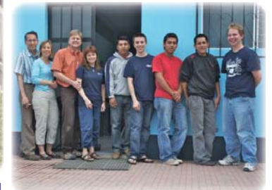
Foothills Alliance Church Calgary AB (May 9-19)