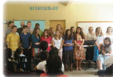
Regina Christian School Regina SK (April 17-28)