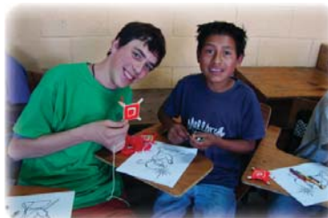
Living Waters Christian Academy, Spruce Grove AB (March 21-31)