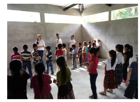
The Chijulhá School Building was used for the first time for Children's Ministry, in anticipation of the school opening in the new year.