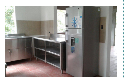
The kitchen in the Baby Home has its appliances and is looking great! Thank you, Foothills Alliance Ladies team.