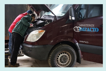
Maintaining an Impact vehicle

* In Guatemala, children attend school from 7:30 a.m. until lunch time. We have received special authorization to run an afternoon program in four of our facilities – hence 7 facilities with 10 school programs.