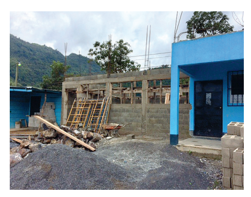
Construction at Vida Nueva is ongoing as we work on building the next classroom.