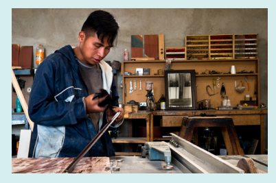
Local worker at the Impact carpentry shop