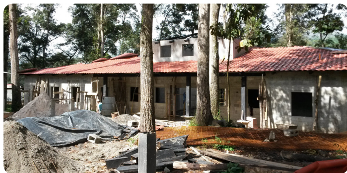
Baby House – December 2016

The first phase of the Fountain of Life Children's Home is progressing well, with the baby home nearing completion. The first phase also includes staff housing, for which construction is well under way.