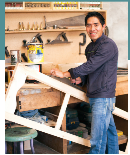
We are now working on furnishing the baby home - including with cribs handmade by Guatemalans in our woodworking shop!

Thank you for your generosity and all that it means in the lives of precious children!