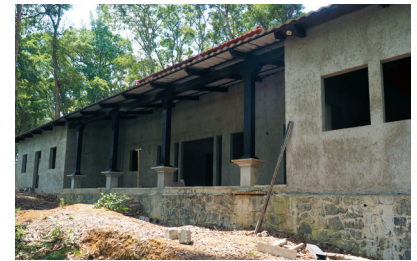
The infant house in the first phase of the Fountain of Life Children's Home.