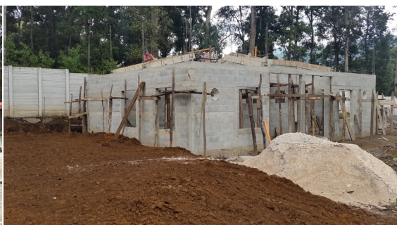
Future staff housing construction progress.