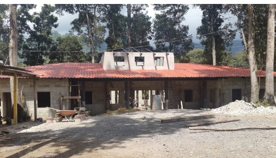
Progress on the baby home construction.