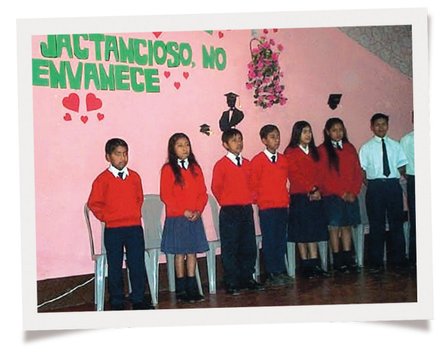
"By the time I graduated from Junior High, my teachers had taught me how to protect my life, to watch over it, to seek the Lord, and to always do things correctly"

Changes are coming to Vida Chamché. Impact Ministries is starting construction on the Chamché rebuild. "It will be a