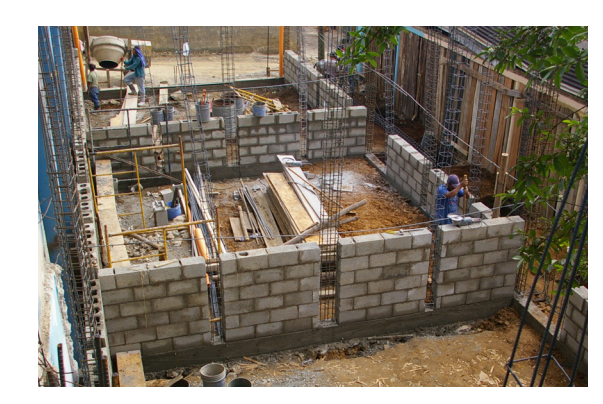
Help rebuild Chamché

Will you consider a gift towards the rebuild of this original Vida school? Give at www.impactministries.ca/rebuild.