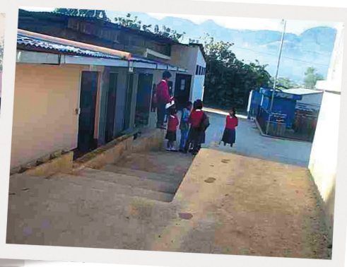
Vida Chamché as Colegia Beerseba

The first phase will include construction of three lower-level classrooms. We've